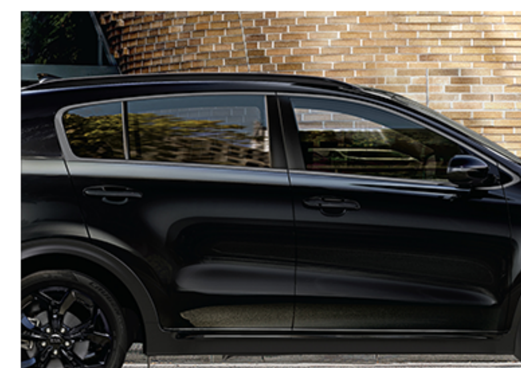
Dark Window Molding