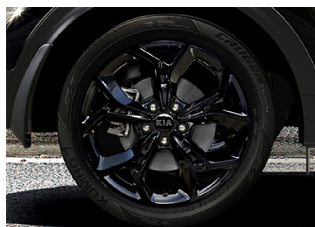
19" Black Alloy