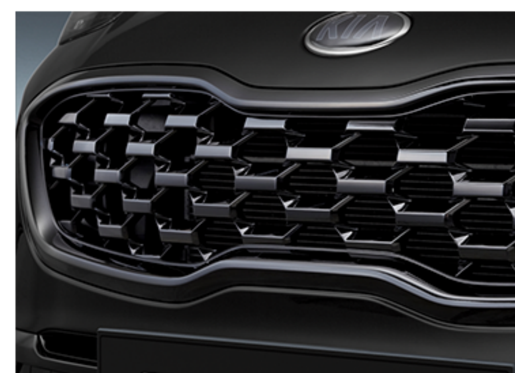
High-Gloss Black Grille