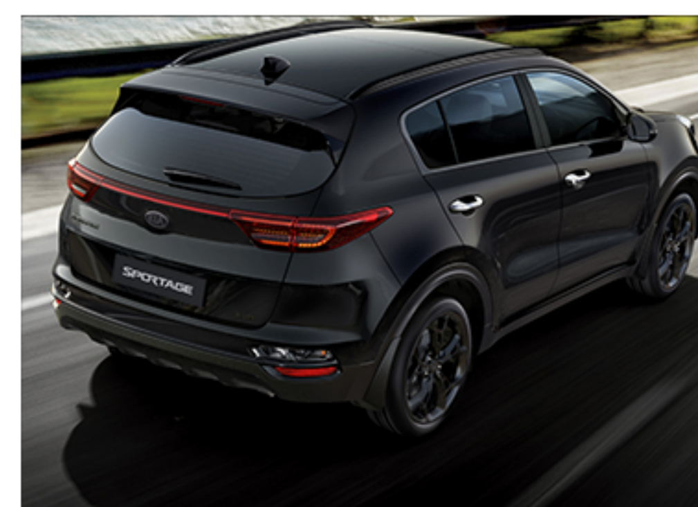
Glossy Black Skid Plate