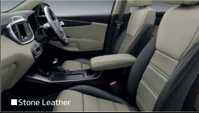
■ Stone Leather