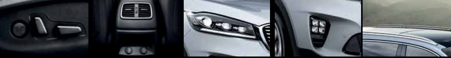
Powered Seats (10-way Adjustable Driver + 8-way Adjustable Passenger)* Rear Air Ventilation and Power Supply Projection Front Light System with DRL Ice Cube LED Fog Lamps Roof Rack