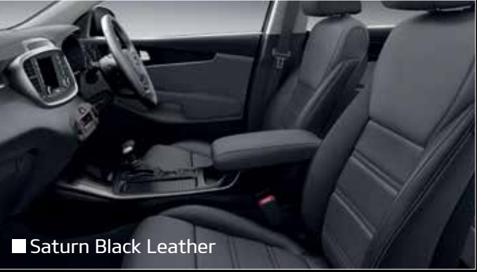
■ Saturn Black Leather