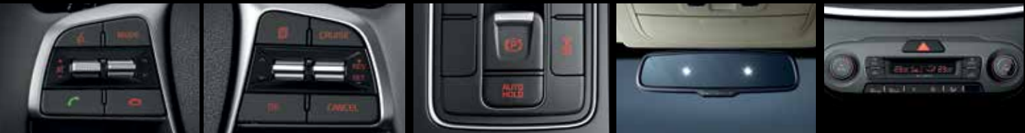
Audio Controls on Steering Wheel Cruise Control on Steering Wheel Electronic Parking Brake Electronic Chromic Mirror Dual Zone Independent Climate Control