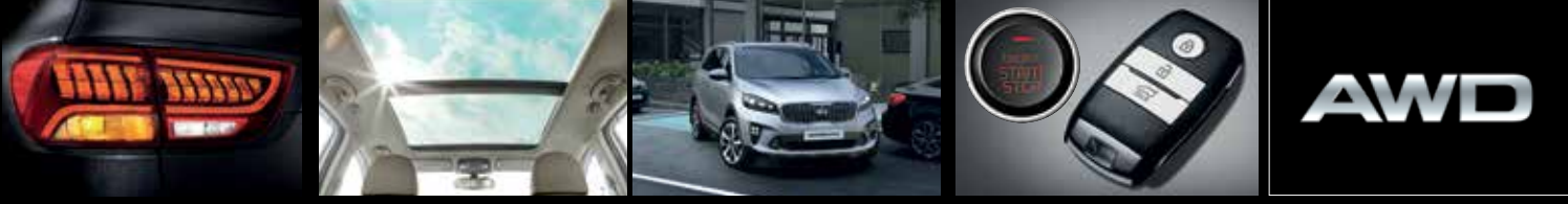
LED Tail Lamps and Stop Lamps Panoramic Sunroof Front and Rear Parking Sensors Push Start with Smart Entry All Wheel Drive*