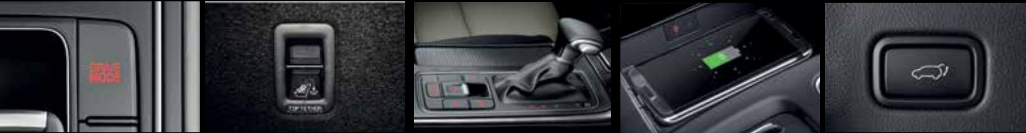
4 Drive Modes* ISO Child Anchors 8-Speed Automatic Transmission* Wireless Smartphone Charger* Smart Auto Tailgate with Memory Function*